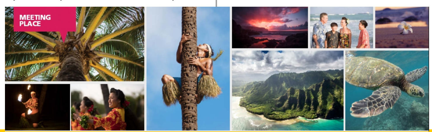
04 Page RED Chronicle Issue 1920-19

Hike up the Leahi peak at Diamond Head State MonumentGolf at one of the area's stunning courses